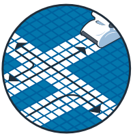
Full pool scanning

Gain heavy-duty cleaning performance, with robust reliability for long-term, cost-effective operation. Dolphin Commercial robotic cleaners from Maytronics are the proven, professional solution for any commercial Olympic pool – from small public pools to the largest, professional pools. Advanced technologies ensure comprehensive scanning of the entire pool and highly effective brushing and filtering throughout. With fully automated operation, your staff can focus on other tasks and your pool water is left sparkling clear and hygienic after every cleaning cycle.