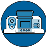
MMI interactive digital interface