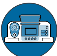
MMI interactive digital interface