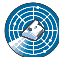
CleaverClean scanning system