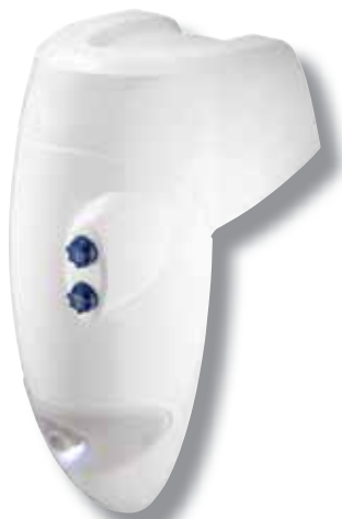
Riva System As per price list coming Early 2013