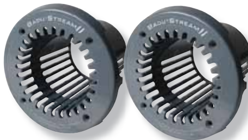
Badu Stream II Grey