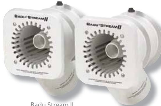
Badu Stream II White