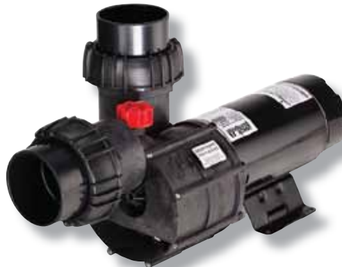
Badu 21/80 Pump