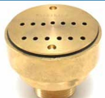
Crown Jet Nozzle Flush Mounted to the Deck. Interchangeable for Multiple Effects WMF076