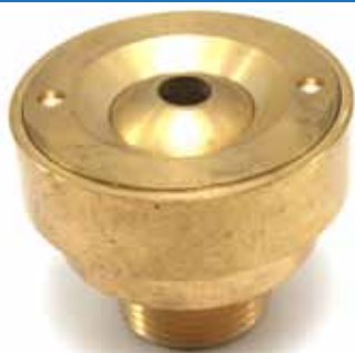
Stream Jet Nozzle Flush Mounted to the Deck. Interchangeable for Multiple Effects WMD100

WMV117/118/119 (LED) WMV107 (Fiberoptic)