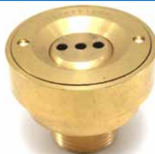
TriStream Jet Nozzle Flush Mounted to the Deck. Interchangeable for Multiple Effects WMD115