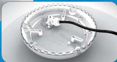
Step 2. Push into rear of light and tighten screws.