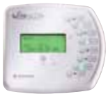
EasyTouch System Indoor Control Panel (for 4 or 8 function control)

EasyTouch® systems are available for a separate spa, a separate pool, or a pool/spa combination with shared equipment. You select from systems that control four or eight accessory functions. Four-function systems are typically used to control pool and/or spa operation plus pool or spa lights and heaters. Eight-function systems allow separate scheduling for additional features, such as landscape lighting, waterfalls, fountains, additional heaters and more. Take the work and worry out of scheduling and operating pool and spa heating, filtration and cleaning cycles. For even greater convenience, you can add any of these optional controllers: